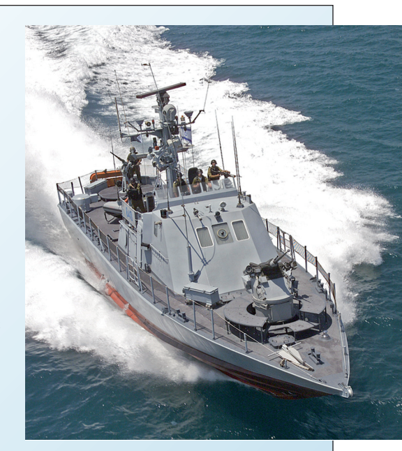
Fig. B: The SHALDAG is a very fast craft with exceptional manoeuvrability. Add to these the fact that the SHALDAG's armament is for ranges of above 2,000 yards, our doctrine is that there is no need for extra protection or armour, says the General Manager of ISL.

SHAHAF: The SHALDAG is a very fast craft with exceptional manoeuvrability. Add to these the fact that the SHALDAG's armament is for ranges of above 2,000 yards, our doctrine is that there is no need for extra protection or armour. The SHALDAG can be operated in a way that will keep it away from the target's firing range which is the best way to protect it (see figure B).