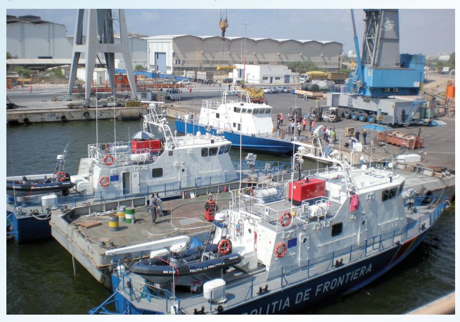
Fig. A: The SHALDAG is constructed as a 'tailor-made' craft and it is servicing different types of coastal defence units, such as Navies, Coast Guards, Border Police (Romanian Border Police SHALDAG seen here), Marine Police, Customs.

SHAHAF: A huge effort was invested in choosing the best propulsion system. Compared to surface propelled vessel the water-jet is more suitable for coastal defence missions. Some of the advantages are: (1) No exposed propeller to hit underwater objects; (2) lower noise and vibration levels; (3) no cavitation (if the size is properly chosen); (4) the manoeuvrability of a water-jet propelled boat is superior; (5) water-jets are designed to absorb maximum engine power at any boat speed, which results in longer engine